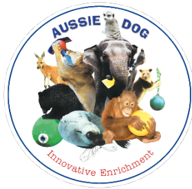
Aussie Dog Silver Sponsor