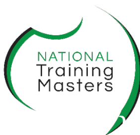
National Training Masters Bronze Sponsor