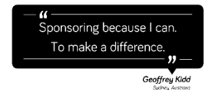
Geoffrey Kidd Bronze Sponsor