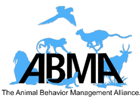
ABMA Bronze Sponsor