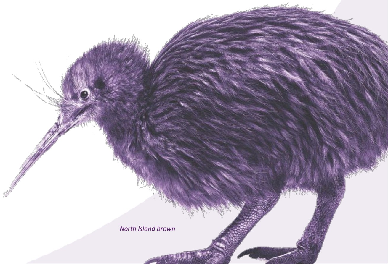
North Island brown

20:00 Buses to Harbourside Function Centre