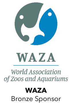
WAZA Bronze Sponsor